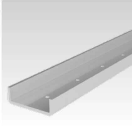
U-profile L = 2,000 mm, pos. 11