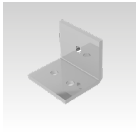
Angle for duct holder, pos. 15