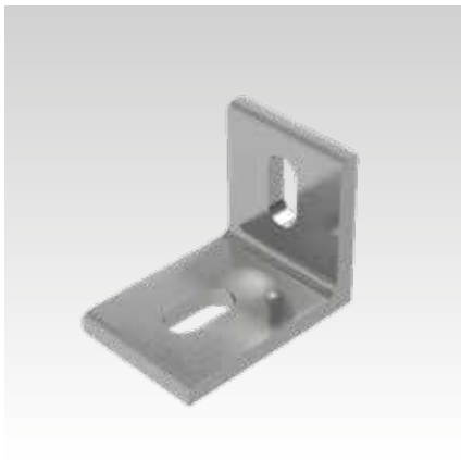
Angle for air mixing box, pos. 13