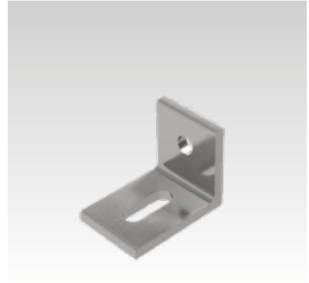
Angle for air mixing box, pos. 12