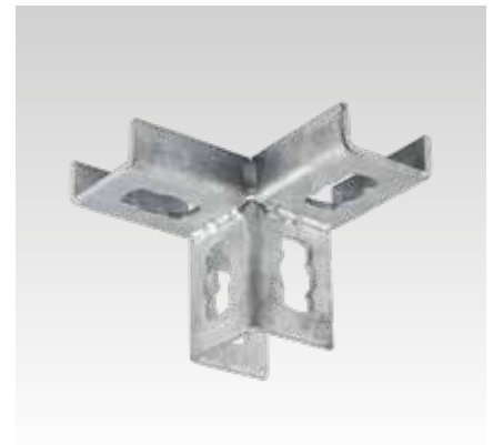
MPR-Corner connector right type S+1