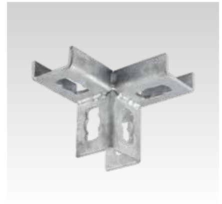
MPR-Corner connector left type S+1