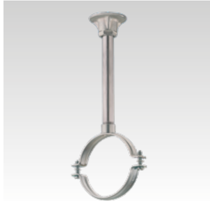
Mounting as anchor assembly with pipe nipple and single bossed clamp with connecting socket