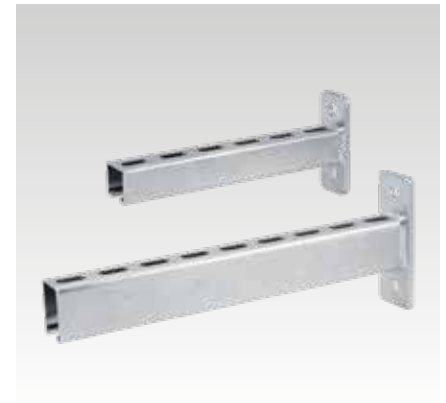
Wall hanger brackets with VdS certificate