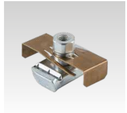
MPR-Quick fastener adapter for light series