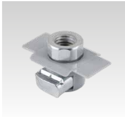
MPR-Quick fastener adapter for heavy series size