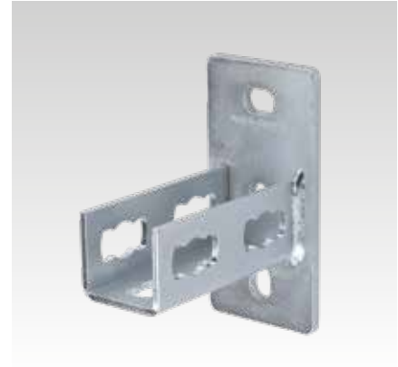
MPR-Saddle support type S+ for profiles 41/41 and 41/62