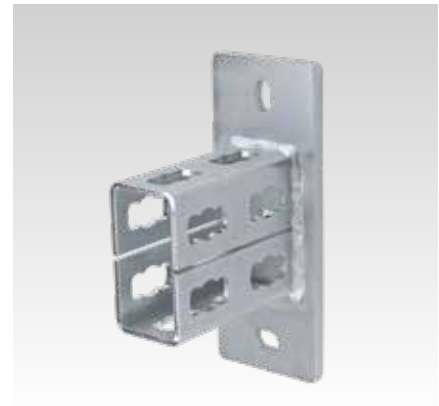
MPR-Saddle support type S+ for profiles 41/82 and 41/124