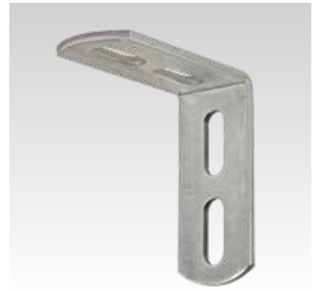
Mounting angle 90°, type 3, light