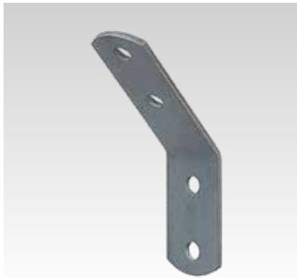
Mounting angle 45°