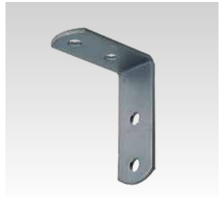
Mounting angle 90°