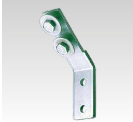
Mounting angle 45°