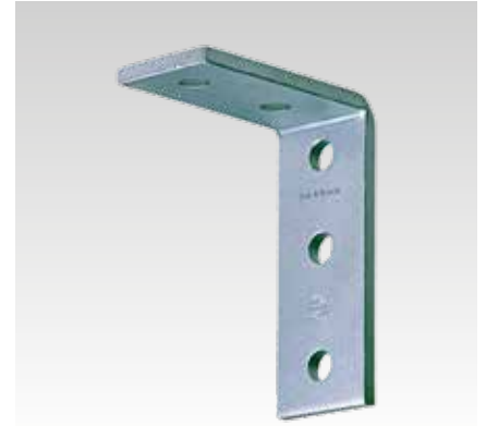
Mounting angle 90°