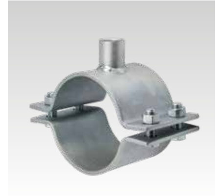
Anchor point pipe clamp 120 x 6