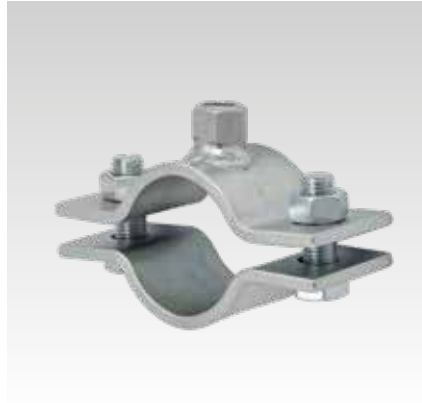
Anchor point pipe clamp 60 x 6