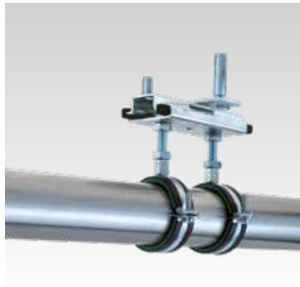
Ceiling installation with steel anchors M8