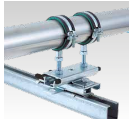
Upright installation of two slide guides in crisscross arrangement, on a MPC-Support channel